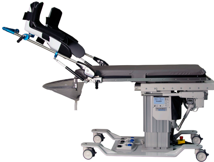
(Shown with optional accessories)