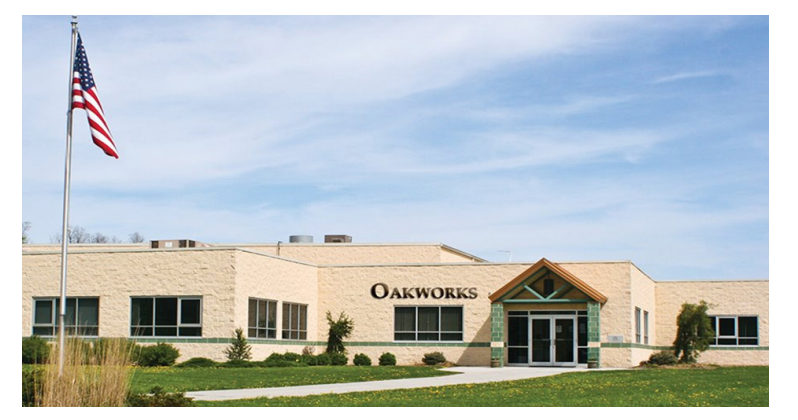
Oakworks, Inc. is ISO 13485 certified plant. All our products are built in our state-of-the-art 91,000 square foot fatory in New Freedom, Pennsylvania.