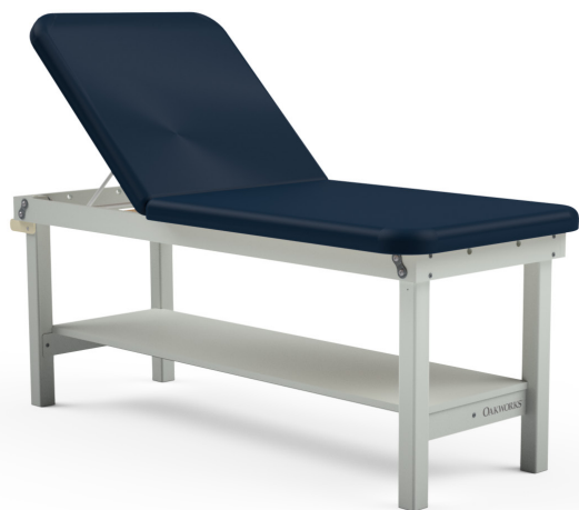
Sapphire fabric, Grey finish and optional storage shelf