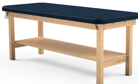
Sapphire fabric, Natural Finish and optional storage shelf