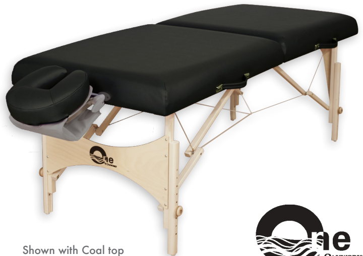
Shown with Coal top