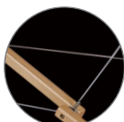
CABLE LOCK SYSTEM