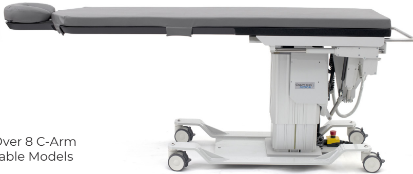
Over 8 C-Arm Table Models

Offering a unique commitment to U.S. manufacturing and environmental wellness, Oakworks is setting the global standard for medical and spa tables.