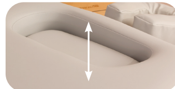
Electric adjustments Large adjustment range