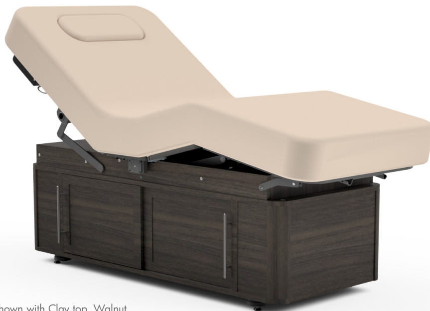
Shown with Clay top, Walnut cabinet and optional ABC System

The Celesta, the ultimate in luxury with exquisite design, superior comfort and fully electric functionality will transform the spa experience. Featuring Oakworks unique 4 electric motor system and now standard with a removable and replaceable padded top. The clean lines foster a sense of elegant simplicity, while the custom-designed cabinetry, complete with electrical outlets inside the cabinet, adds a functionality that makes incorporating a hot towel cabi a convenient reality.