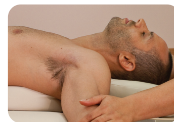
Pectoral muscle stretch Advanced positioning