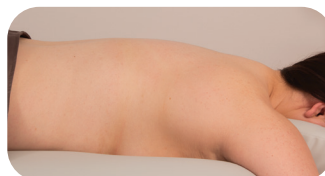
Incredible breast comfort Lower to lessen pressure

(Comes with Boiance face rest pad and QuickLock face rest)