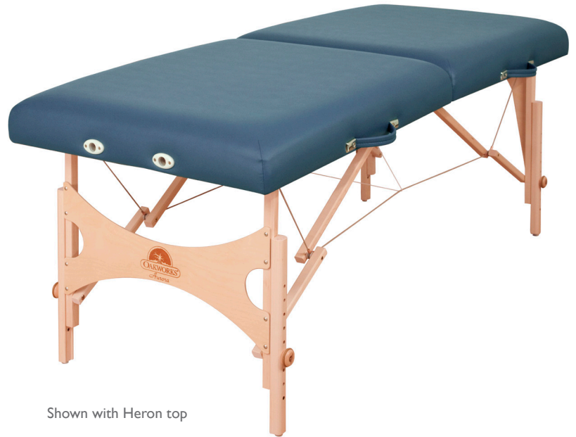
Shown with Heron top

A lightweight wood table specifically constructed for the massage professional whose practice requires constant travel. Designed to withstand the rigors of everyday use, the Aurora™ offers ultimate client comfort, and the strength to last an entire career. Truly a flawless investment for any massage therapist.