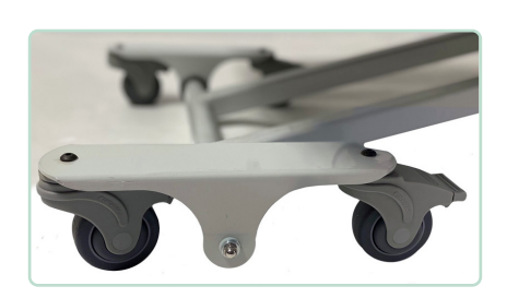
Optional Locking Twin Casters