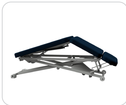
PHYSICAL THERAPY TABLES