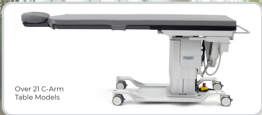
Over 21 C-Arm Table Models

Offering a unique commitment to U.S. manufacturing and environmental wellness, Oakworks is setting the global standard for medical and spa tables.