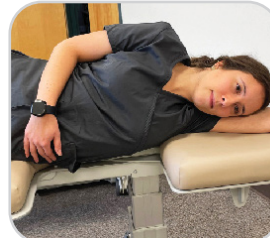
POWERED CARDIO PANEL