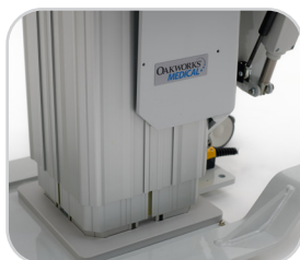
ROBUST LIFTING TOWER