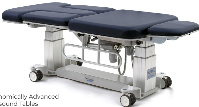
Ergonomically Advanced Ultrasound Tables

Oakworks has been providing customers with innovative medical equipment, excellent service, and cost effective solutions for over 40 years.